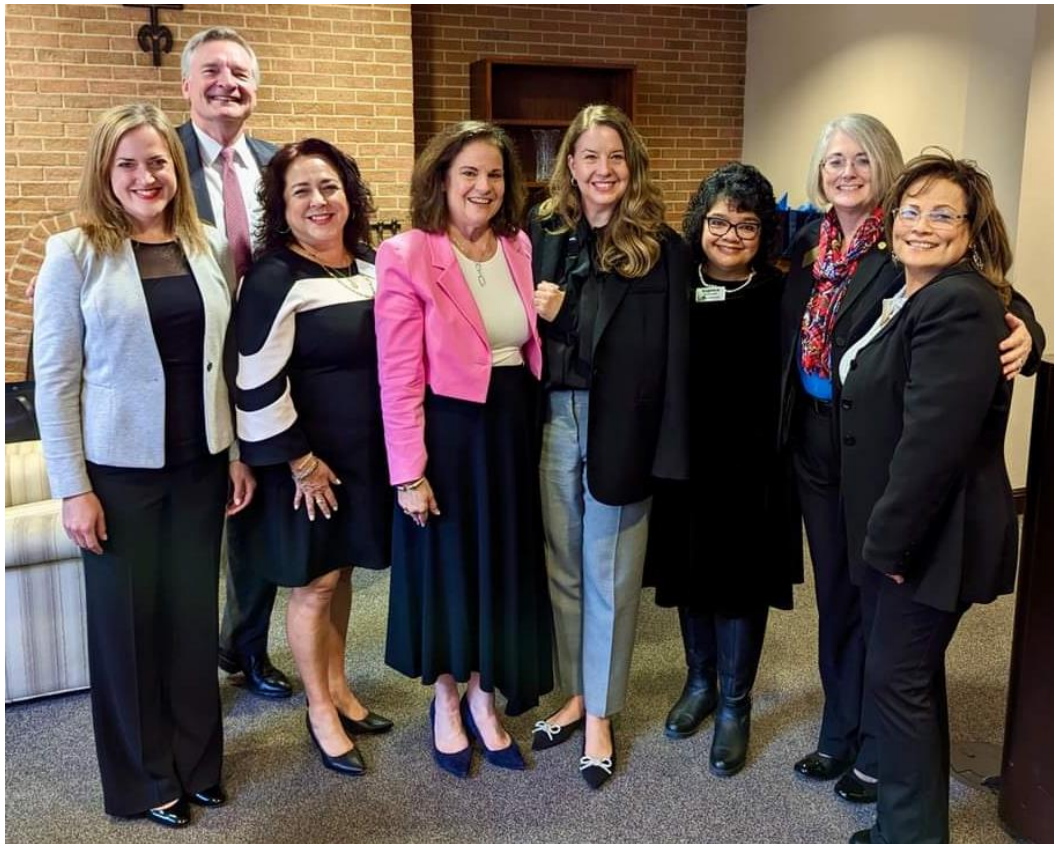
SBOT Leadership and St. Mary's Law School Dean